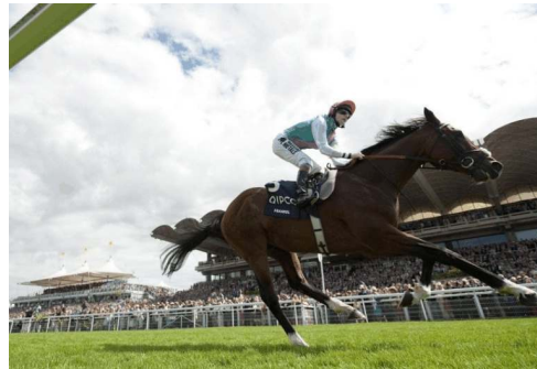
Frankel makes it an even dozen in the Sussex